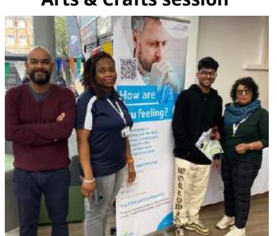
Mental Awareness Event at DMU