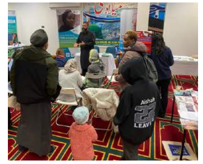
Health Event at Jamia Masjid e Bilal