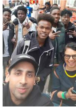
Music Workshop at Freedom Youth Club